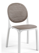
BIANCO TORTORA 40239.00.010